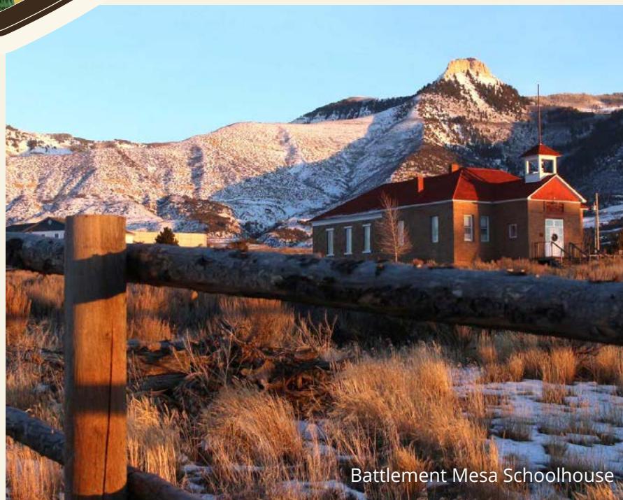
Battlement Mesa Schoolhouse