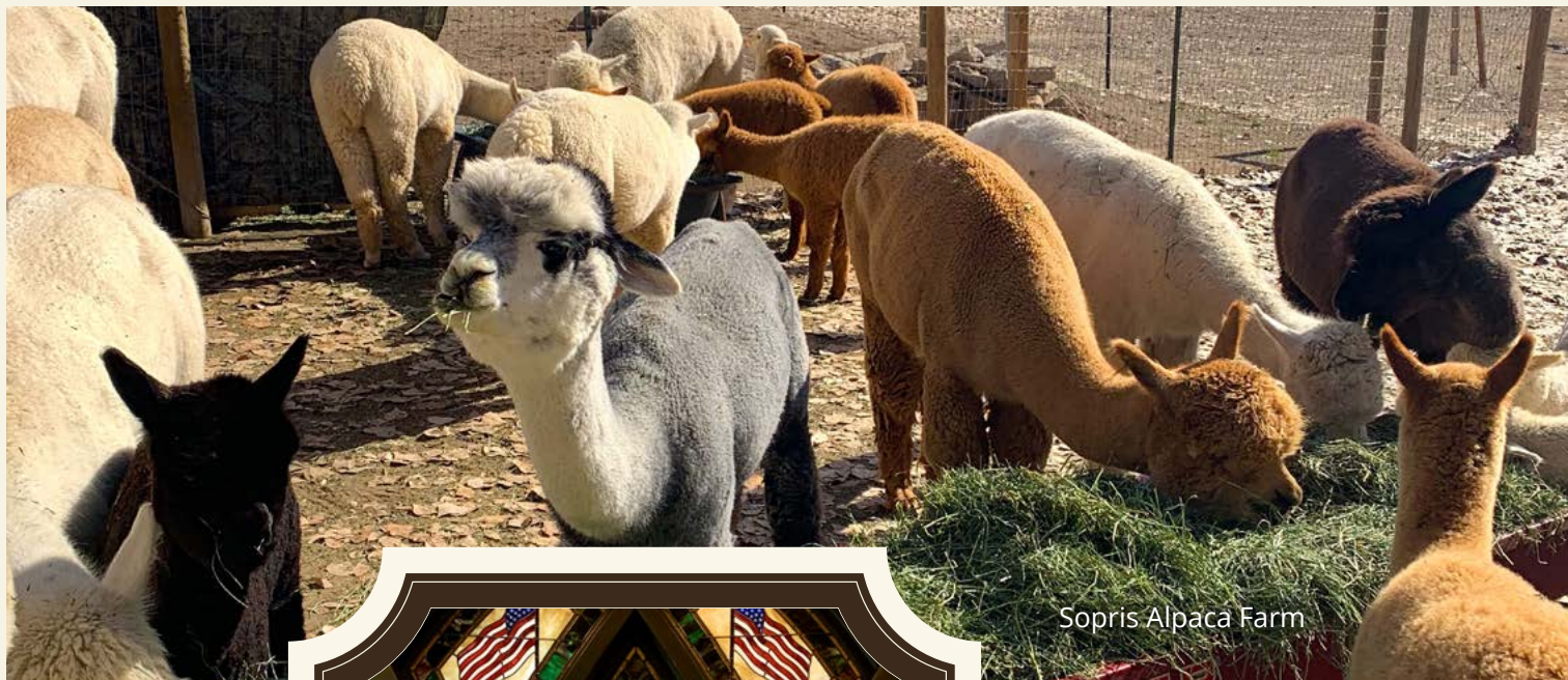
Sopris Alpaca Farm