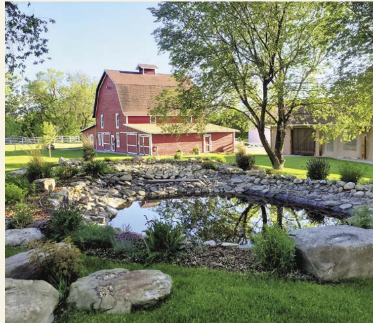
Red Barn Guest Ranch