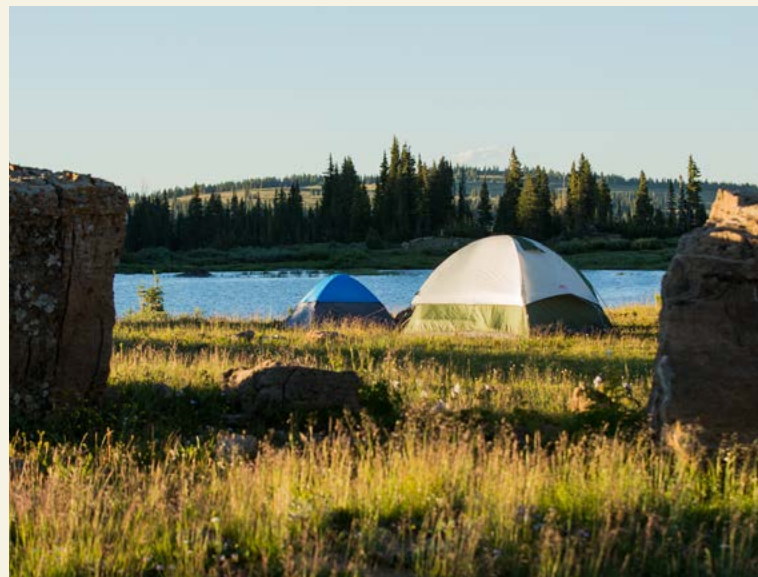
Camping in the Flat Tops Wilderness