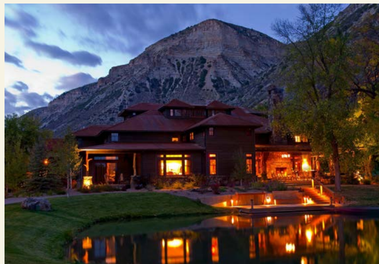
Branded Rock Canyon