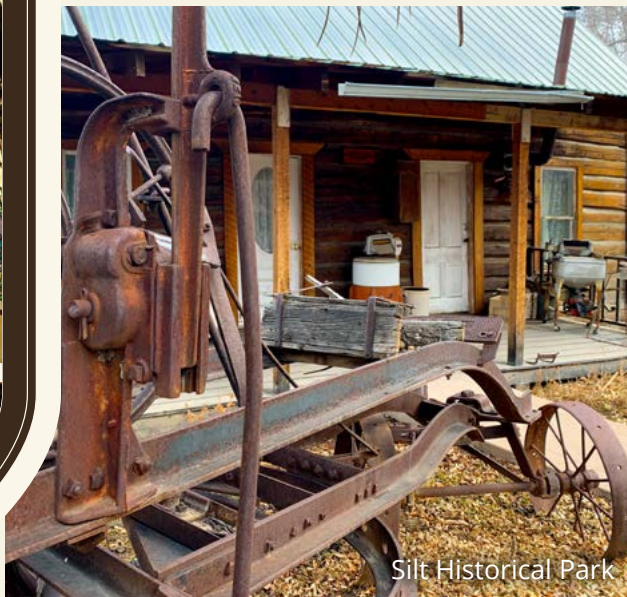
Silt Historical Park