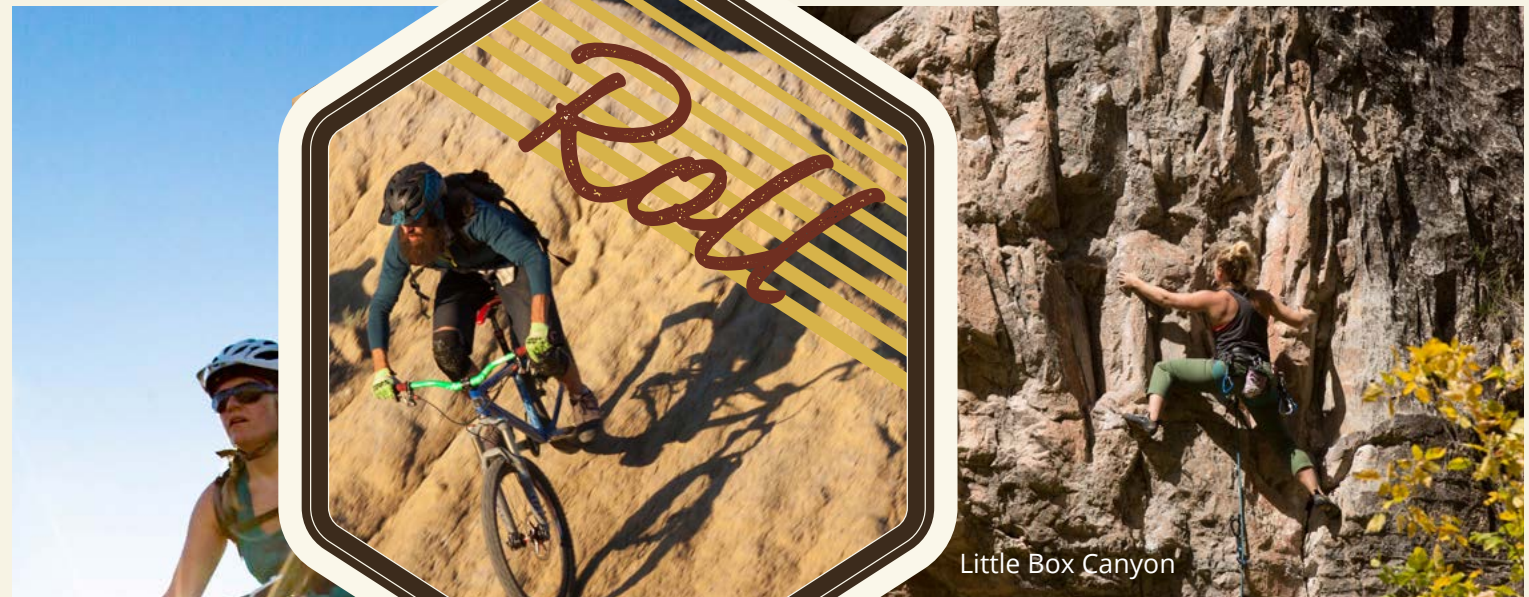
Little Box Canyon