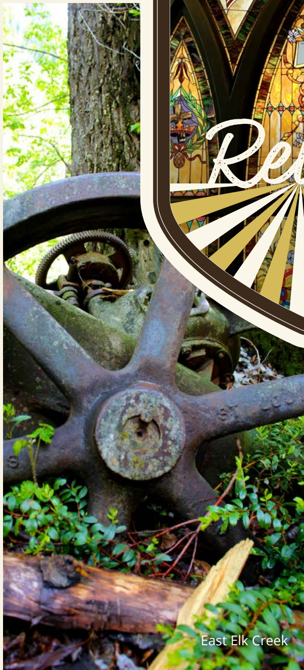
East Elk Creek